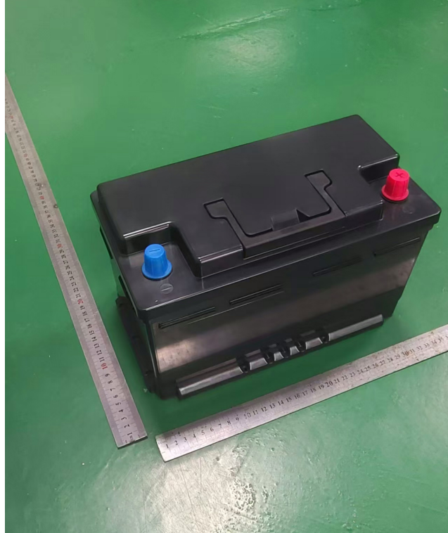
Figure 1 Overall view I of battery (电池外观图I)