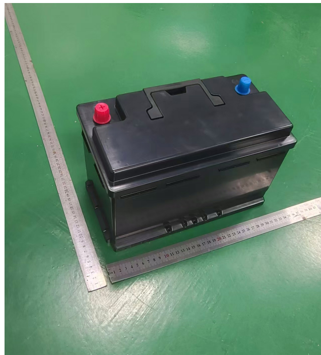
Figure 2 Overall view II of battery (电池外观图II)