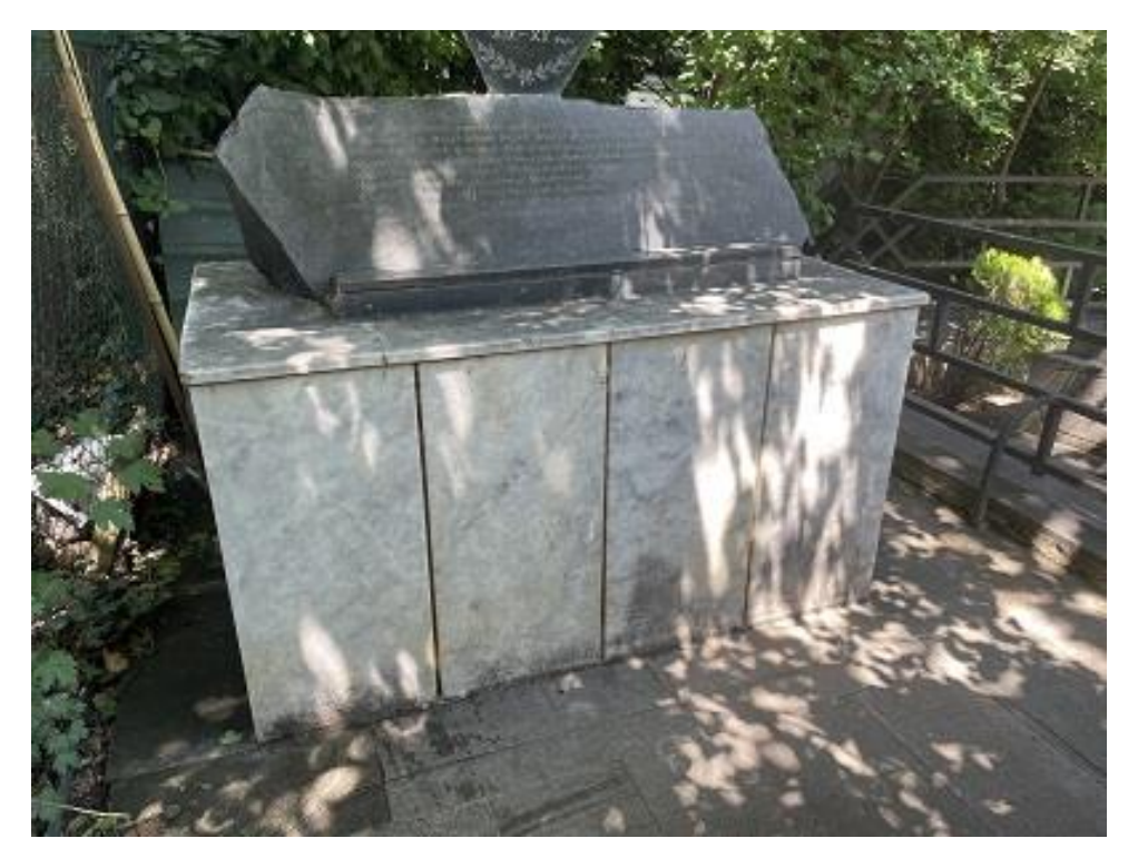
4-Total area of 1m2 bazalt renovation on the floor.

3-Cleaning of marble. Sizes 170x90x90 h.